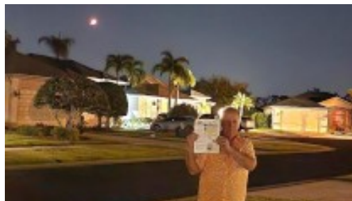
Preston watches SpaceX Falcon 9 rocket launch into space to deploy 23 satellites.